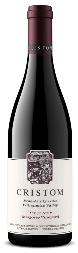
97 & EC IWR 96 Decanter 96 O. Bargreen 94 KWGTP 93 Vinous